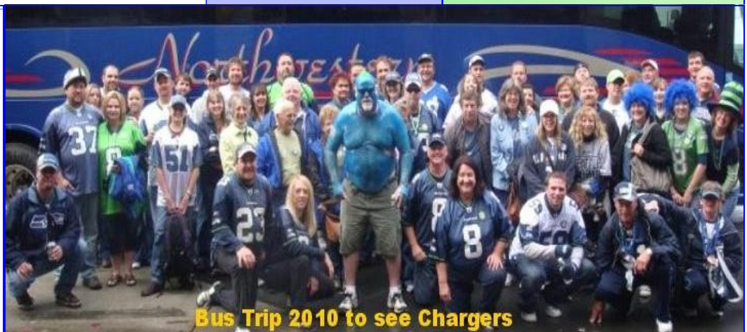
Bus Trip 2010 to see Chargers