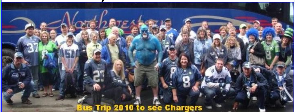
Bus Trip 2010 to see Chargers

You aren't worried about the players being locked out and are ready for the season.